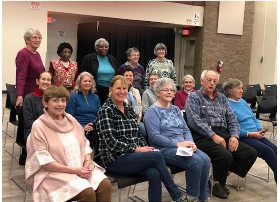
Some of the kitchen workers getting ready to watch the ceremony after preparing the food