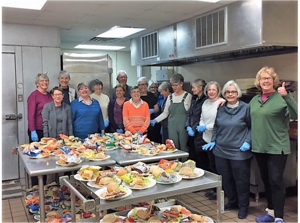
Helpers at Martin Luther King, Jr. Celebration 2019