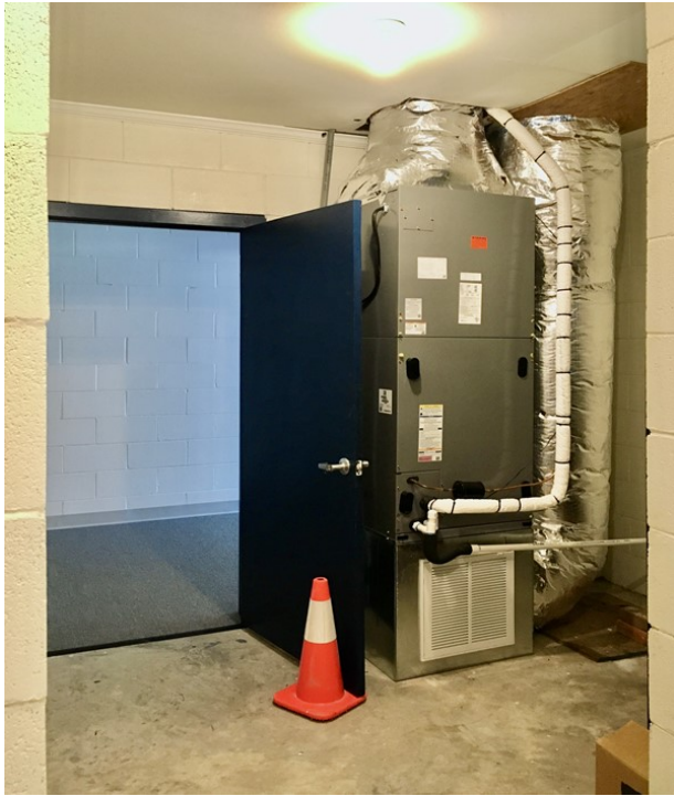
HVAC and Ductwork