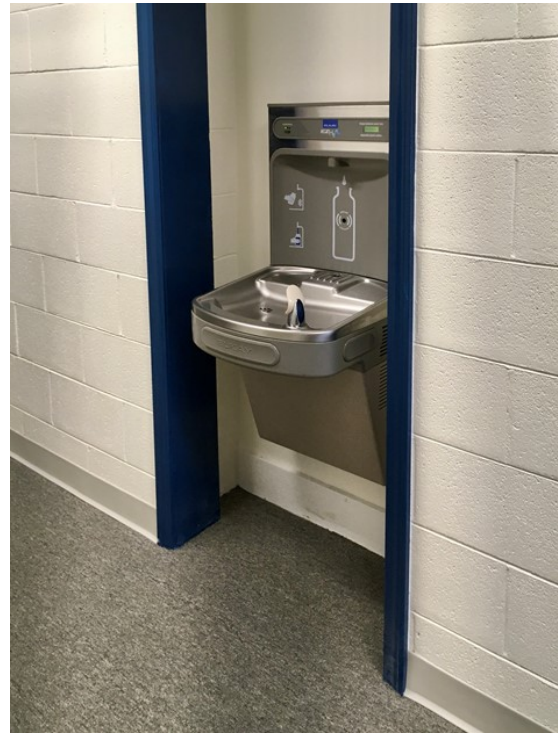
ADA Water Fountain and Bottle Filler