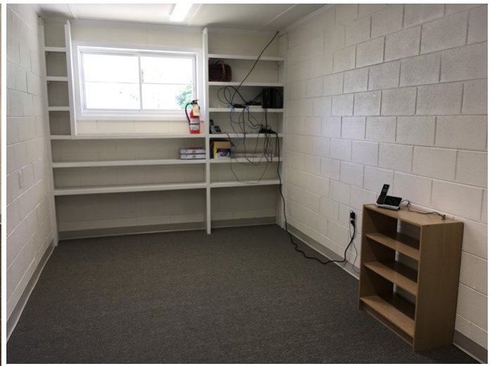
Office Assistant's Office