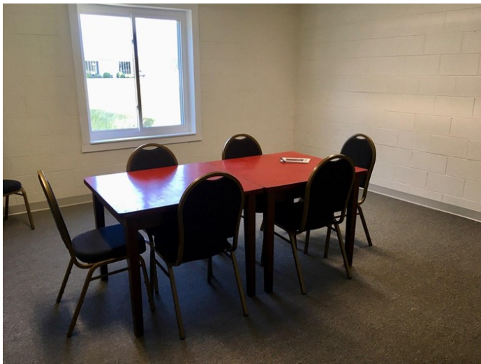
Classroom with new window