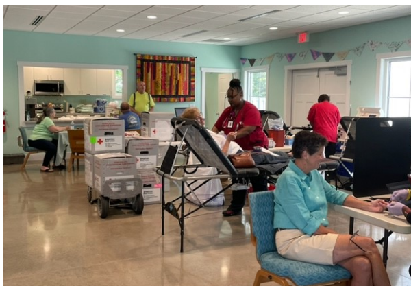
Left: UCF Blood Drive, July 25th