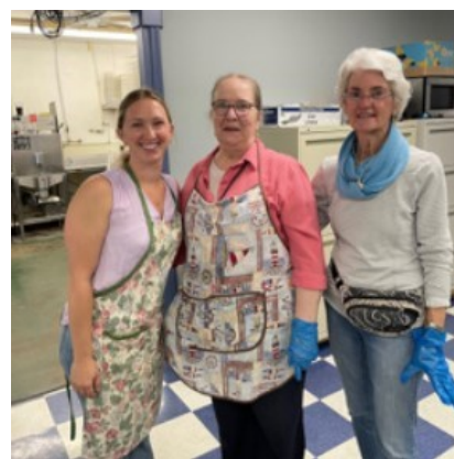
Right: The Hope Mission Crew