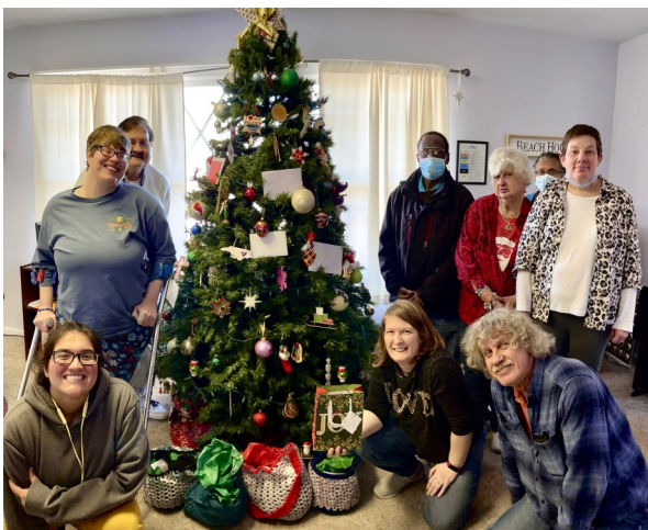
Left: Beach House Clients posing with their holiday gift bags.

Please give generously during the months of September and October to help us fund our holiday giving. You can write a check to UCF and put Share the Plate in the memo line. You can either put that check in the collection plate or mail it to Joan Burton, Treasurer, UCF, PO Box 425, Morehead City 28557. You can also donate through your Breeze account or on Paypal on the UCF website: https://ucfnc.org/ . Again, be sure to select Share the Plate if you give online. Each Sunday in September and October all cash donations in the collection plate that are not marked as a pledge, will also go to the Share the Plate collection for Holiday Giving.